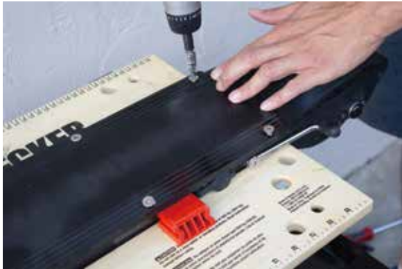
1. Open the foot deck using a hex driver (8 screws).