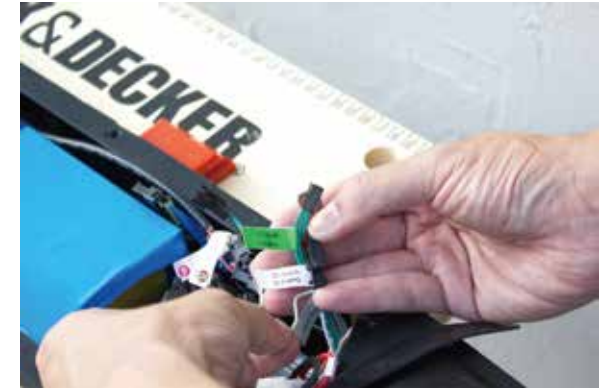
2. Identify 3 pairs of connectors with matching colors (labeled kick-start, 12.5 mph, and 7.5 mph) near the rear wheel wire.