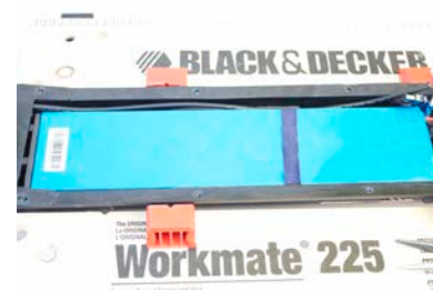
A2. Check the orientation of the battery. Barcode should be on the top.