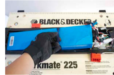
A3. Lift up the battery, then you will see all connectors connected to the battery.