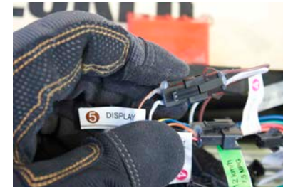
A3. Cut off all the cable ties on the connectors. Disconnect the connectors with the following labels: 1.Load, 5.Display and 6.Charge. Then take out the battery to change another new one.