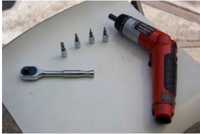
A0. Prepare the tools.